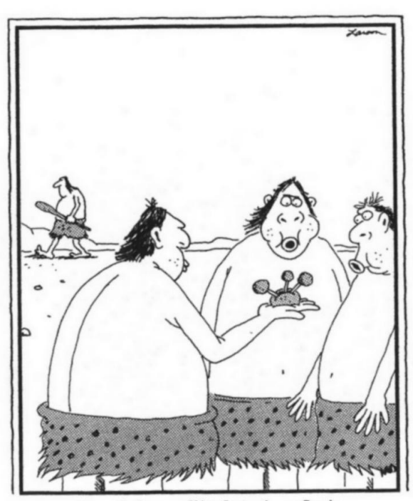
Danook shows off his Swiss Army Rock. Complete with bow, a perfect holiday gift.

One of the earliest multifunctional tools was the Swiss Army Knife (SAK), a Stone Age version of which is shown below.